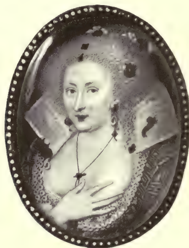
QUEEN ANNE OF DENMARK BY ISAAC OLIVER